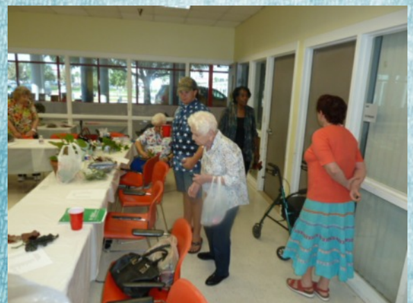
Break between Business Meeting & Program (Cuttings Swap)