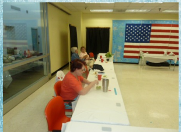
Waiting for the meeting to be called to order.