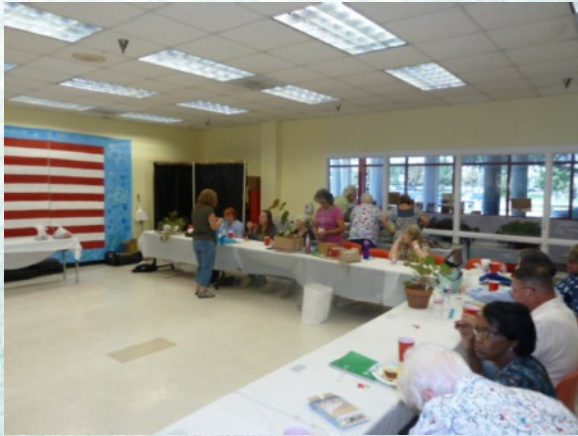
Meeting in progress.